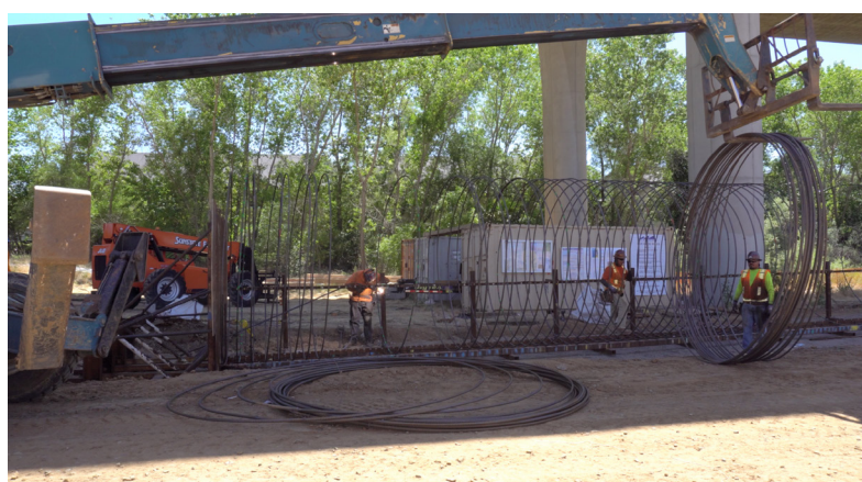
Construction crews assembling rebar for 100-foot foundations to support a third lane on Highway 65

Recently, night-time crews began installing construction barriers on Highway 65, the Galleria on-ramp to southbound 65, at the northbound 65 off-ramp to Stanford Ranch Road, and along Taylor Road.